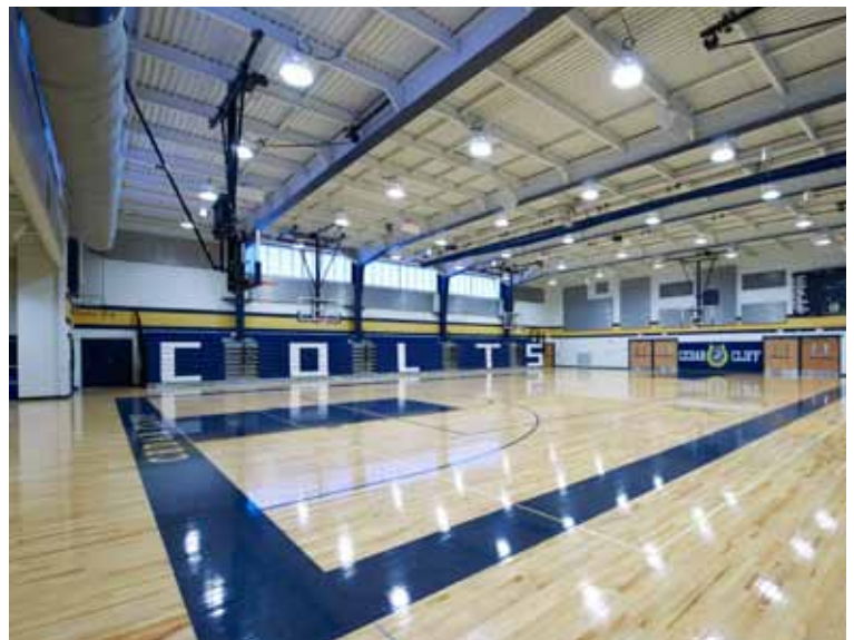
CEDAR CLIFF HIGH SCHOOL