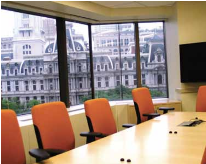
PENN MEDICINE CENTER FOR INNOVATION & LEARNING

VERTICAL SCREEN HEADQUARTERS Warminster, PA Owner: Vertical Screen Architect: Erdy McHenry Architects