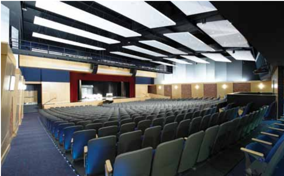
RED LAND HIGH SCHOOL

SINACOM NORTH AMERICA King of Prussia, PA Owner: Sea-Z, LLC Architect: Environetic Design, Inc.