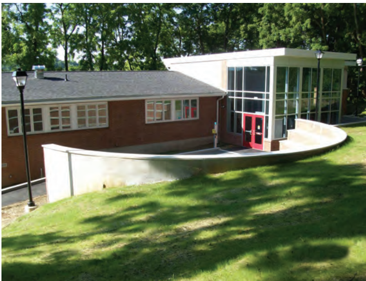
MUHLENBERG COLLEGE REHEARSAL HOUSE