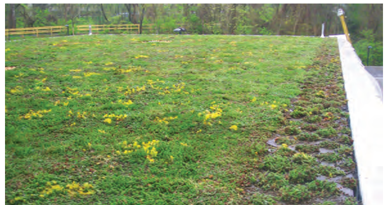
Penn Medicine at Valley Forge features a vegetated roof.