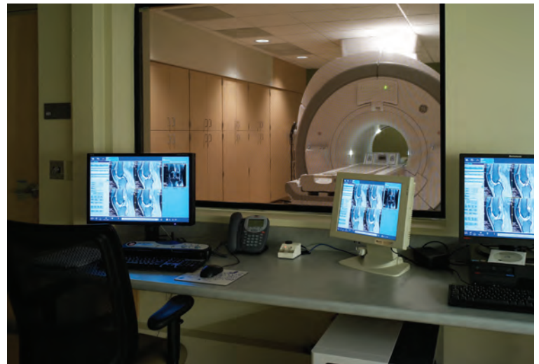
Penn Medicine at Valley Forge Imaging Center