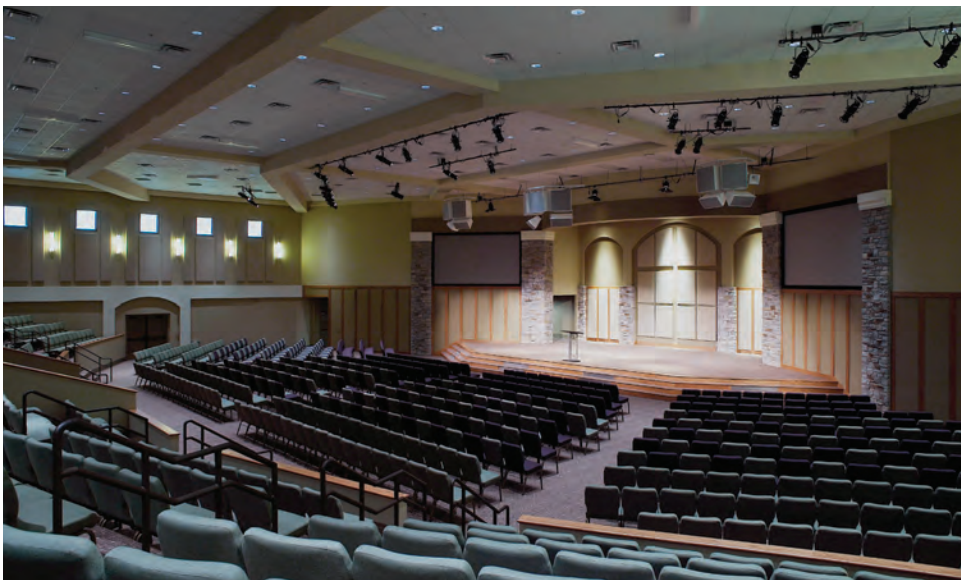
SOVEREIGN GRACE CHURCH