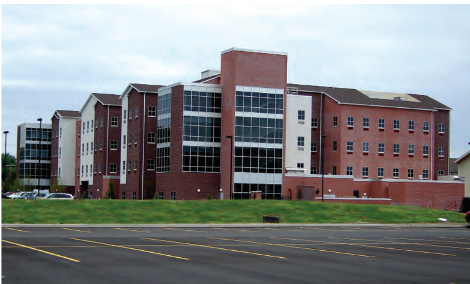
PENNSYLVANIA COLLEGE OF TECHNOLOGY DAUPHIN HALL STUDENT HOUSING